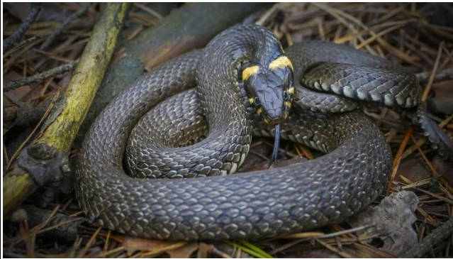
Garbul } }