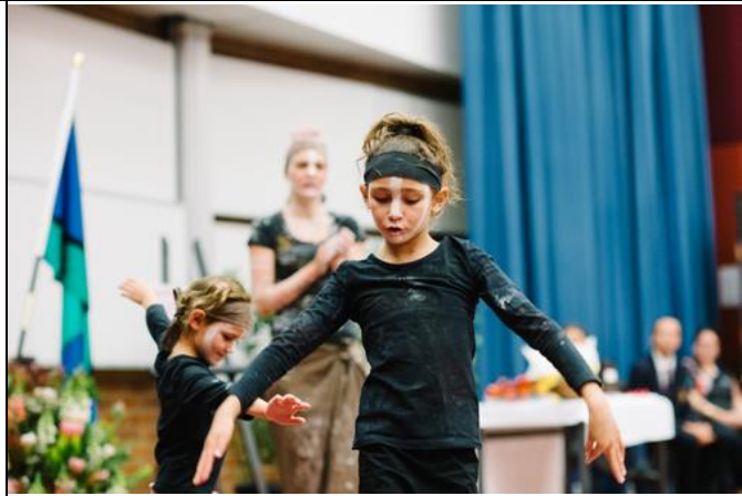
Right and left: Photo by USQ Photography