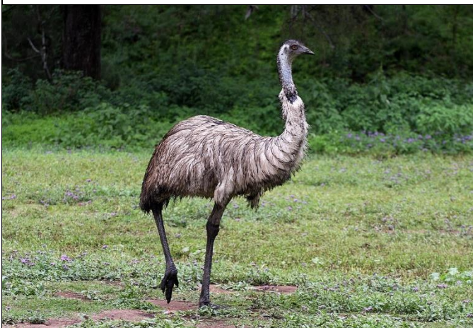
Gnui } }